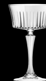
Coupe NEW 677RCR394 26.0cl (9.2oz) h 167mm ø max 100mm