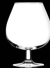
Brandy 668RCR336 67.0cl (22 2 / 3 oz) h 147mm ø max 109mm