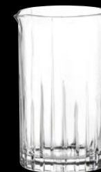
Mixing Jug 664RCR318 65.0cl (22oz) h 160mm ø 97mm