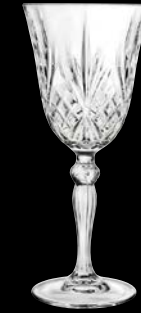
Goblet 670RCR347 27.0cl (9 1 / 8 oz) h 202mm ø max 87mm

An eternal, comforting and versatile line. Melodia is the favourite glassware of millions of customers and is a major player in the world of Mixology where has established itself as an icon.