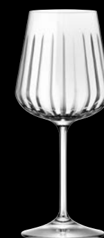
Spritz NEW 677RCR395 49.0cl (17.25oz) h 220mm ø max 96mm

Elegance, unlike fashion, is eternal and gets noticed! Timeless, is a modern collection with unmistakable style, chosen by the biggest alcohol producers for use in their advertising, you will also find it on the set of many major motion pictures and especially in restaurants all over the world.