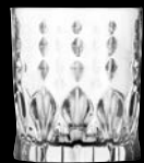
DOF Tumbler 669RCR346 33.7cl (11½oz) h 94mm ø max 82mm