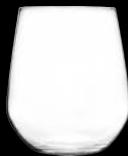
XL Tumbler 678RCR393 43.0cl (15oz) h 99mm ø max 89mm