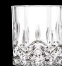
Old Fashioned Tumbler 672RCR368 21.0cl (7 1 / 3 oz) h 85mm ø max 74mm