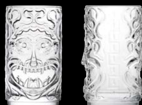
Etruria Tumbler 687RCR450 45.0cl (15 1 / 2 oz) H 136mm Ø 76mm

Half of the glass is decorated, while the other half is smooth, a feature that makes these glasses pleasant to touch and easy to grip. The design combined with the transparency of Eco-Crystal enhances their contents, making them even more beautiful. Particularly sturdy and resistant, they are perfect for everyday use.