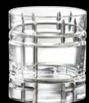
DOF 661RCR307 34.6cl (13 3 / 8 oz) h 94mm ø max 82mm

Combining ingredients and serving cocktails and spirits in these stackable glasses is a joy. Satisfy your Mixology creativity with Combo.