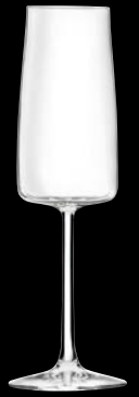
Flute 666RCR325 29.7cl (10oz) h 235mm ø max 76mm