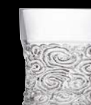
Soul DOF Tumbler 674RCR374 31.9cl (11 1 / 5 oz) h 95mm ø max 86mm