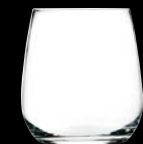
Water Tumbler 668RCR344 37.0cl (13oz) h 92mm ø max 86mm