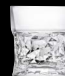
Funky DOF Tumbler 673RCR372 31.9cl (11 1 / 5 oz) h 95mm ø max 86mm