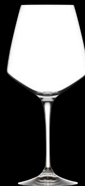
Red Wine Goblet 662RCR308 78.8cl (27 5 / 8 oz) h 246mm ø max 113mm

Designed for the finest table settings, Aria is the top range for RCR collections. These thin glasses are very shock resistant thanks to the high-density of eco-crystal. The design of the glass angles in from its widest point, indicating the right level of wine to be poured, while the wide cone-shaped bowl of the glass allows you to appreciate the gradations of colour at its very best.