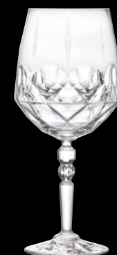
Large Mixing Goblet 660RCR300 67.0cl (23 1 / 2 oz) h 237mm ø max 104mm

The success of the Alkemist range lies in combining the complexity of design with the typical lightness of a tasting glass, an alchemy that makes this line unique and inimitable. The growing demand and suggestions from some of the leading hotels and restaurants in the world led us to develop the water glass and the gin glass. The composition of the line, including goblets and glasses, is suitable for professional use.