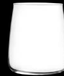
DOF Tumbler 666RCR326 42.0cl (14½oz) h 96mm ø max 84mm