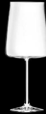
Goblet 666RCR322 65.0cl (22oz) h 235mm ø max 95mm

Designed for modern and minimalist table décor, the flat bowl holds the wine in a trapezoid shape, typical of modern table settings. The refined design expresses this in the slight reopening of the rim which, in addition to enhancing the release of aromas, facilitates the sliding of the liquid during tasting and gives the glass a soft, elegant silhouette.