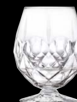
Spirits/Brandy Goblet 660RCR303 53.0cl (18 2 / 3 oz) h 128mm ø max 100mm