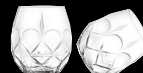
XL DOF Tumbler 660RCR304 38.0cl (13 2 / 5 oz) h 95mm ø max 87mm