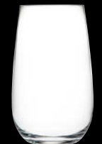
Highball Tumbler 668RCR343 48.0cl (16 2 / 3 oz) h 132mm ø max 80mm