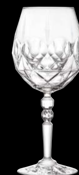
Cocktail/Aperitif Goblet 660RCR302 53.2cl (18 2 / 3 oz) h 225mm ø max 100mm