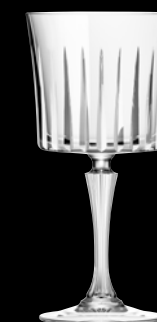
Cocktail NEW 677RCR397 50.0cl (17.6oz) h 208mm ø max 103mm