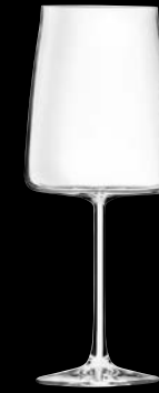
Goblet 666RCR323 54.7cl (18½oz) h 227mm ø max 90mm