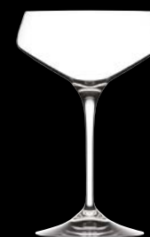
Champagne Saucer 662RCR312 33.5cl (11 1 / 2 oz) h 170mm ø max 114mm