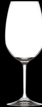
Gran Cuvee 668RCR333 66.4cl (22 1 / 2 oz) h 240mm ø max 92mm

This line has been conceived to meet all the demands of wine lovers. Goblets, glasses and decanters feature a classic design, which is both elegant and international.