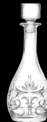
Tall Decanter 676RCR383 96.0cl (33 1 / 5 oz) h 263mm ø max 121mm