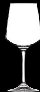
All Wine Goblet 662RCR311 38cl (13 2 / 5 oz) h 206mm ø max 85mm