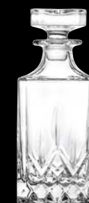
Square Whisky Decanter 672RCR370 75.0cl (26 2 / 3 oz) h 188mm