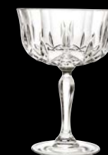
Champagne Saucer 672RCR364 24.0cl (8 1 / 3 oz) h 140mm ø max 100mm