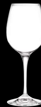
Large Wine Goblet 668RCR334 56.0cl (19oz) h 235mm ø max 93mm