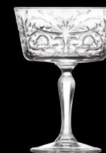
Champagne Saucer 676RCR378 26.8cl (9 3 / 5 oz) h 140mm ø max 100mm