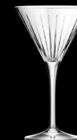
Martini NEW 677RCR396 21.0cl (7.35oz) h 180mm ø max 103mm