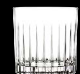
DOF Tumbler 677RCR388 36.0cl (12½oz) h 92mm ø max 86mm