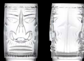
Sardinia Tumbler 688RCR451 46.0cl (16 1 / 5 oz) H 136mm Ø 76mm