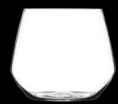
Large Tumbler 662RCR313 55.0cl (19 1 / 3 oz) h 90mm ø max 105mm