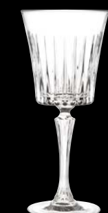
Wine Goblet 677RCR385 23.0cl (8oz) h 200mm ø max 81mm