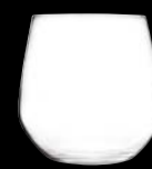
Tumbler 662RCR314 39.0cl (13 2 / 5 oz) h 90mm ø max 89mm