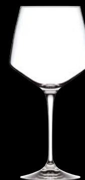
Large Wine Goblet 662RCR309 72.0cl (25 1 / 2 oz) h 231mm ø max 113mm