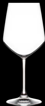
Wine Goblet 678RCR392 54.8cl (19 \frac{1}{2} oz) h 220mm ø max 96mm

The Universum universal goblet is suitable for any type of red, white or sparkling wine. It is ideal for those looking for a multi-functional and accessible table setting, its carefully crafted design makes it especially strong and sturdy for frequent use. The goblet's curvature indicates the ideal amount to pour for tasting and thanks to its versatility, it is also often used to serve aperitifs.