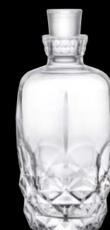
Bottle with Stopper 660RCR306 107.0cl (37 2 / 5 oz) h 214mm ø max 111mm