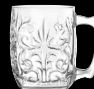
Moscow Mule Mug 676RCR381 43.0cl (14 7 / 5 oz) h 111mm ø max 84mm