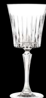
Water/Wine Goblet 677RCR384 29.8cl (10½oz) h 209mm ø max 89mm