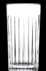
Hiball Tumbler 677RCR387 44.0cl (15½oz) h 150mm ø max 76mm