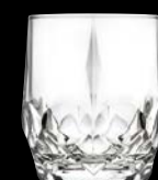
DOF Tumbler 660RCR305 34.6cl (12 1 / 2 oz) h 103mm ø max 87mm