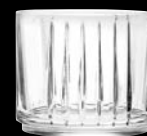
Stacking DOF Tumbler 664RCR319 37.0cl (13oz) h 84mm ø 90mm