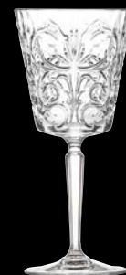
Wine Goblet 676RCR377 29.0cl (10 1 / 5 oz) h 194mm ø max 88mm

Tattoo is a youthful collection with a contemporary style that evokes Body Art aesthetics. The Clessidra tumblers are ideal as a shot glass or jigger, while the Mule mugs go well with any beverage.