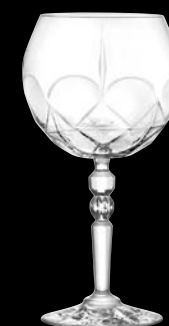
Gin & Tonic Mixer Goblet 660RCR301 58.0cl (20 1 / 2 oz) h 208mm ø max 108mm