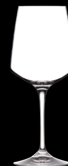
White Wine Goblet 662RCR310 46.2cl (16 1 / 4 oz) h 220mm ø max 91mm