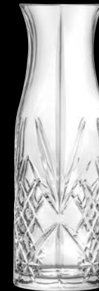
Carafe - No Lid 670RCR356 116.0cl (40 3 / 8 oz) h 270mm ø max 90mm