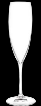
Champagne Flute 668RCR339 24.1cl (8 1 / 2 oz) h 238mm ø max 58mm