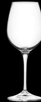
Wine 668RCR335 45.7cl (15 4 / 8 oz) h 220mm ø max 87mm