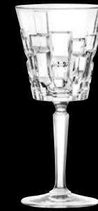
Large Goblet 667RCR327 28.0cl (9½oz) h 194mm ø max 87mm

The Etna collection is inspired by the power of the eruption of the Sicilian volcano. The perfect imperfection of nature is engraved on the glasses and goblets: light is reflected on the carvings and is multiplied on different levels enhancing the exceptional transparency of the Eco-Crystal.