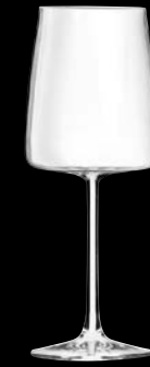
Goblet 666RCR324 43.0cl (15½oz) h 215mm ø max 84mm