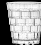
DOF Tumbler 675RCR376 32.0cl (11⅓oz) h 95mm ø max 89mm