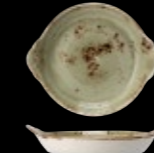
Round Eared Dish