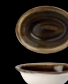
Oval Baker Lipped