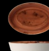
Oval Sole Dish