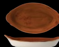
Oval Eared Dish

The Craft cookware range offers a variety of presentation opportunities to demonstrate the delights of oven to table cooking. This collection offers a range of items inspired by hand-crafted, simple country wares.